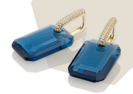
Topaz Quartz Emerald Cut set Silver • Gold plated | €107,90